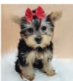
YORKIE PUPPIES ADORABLE, pure bred, toy & teacup sizes. Call 718-306-4136

Want it sold? Sell it in the NEW YORK POST Classifieds