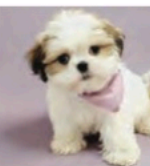
SHIH-TZU PUPPIES Beautiful Males & Females Price to Sell Call 718-306-4136