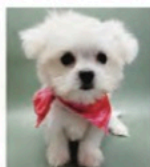
MALTESE PUPPIES Adorable males and females, toy or teacup sizes, shots and papers. Call 718-306-4136