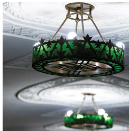
Sustainable and energy saving fixtures illuminate our campus.

Yeshiva University continues its commitment to creating a dynamic and supportive environment for its students through these ongoing projects. With the help of various funding sources, the university is enhancing its educational facilities and realizing its goal of building a better campus for all.