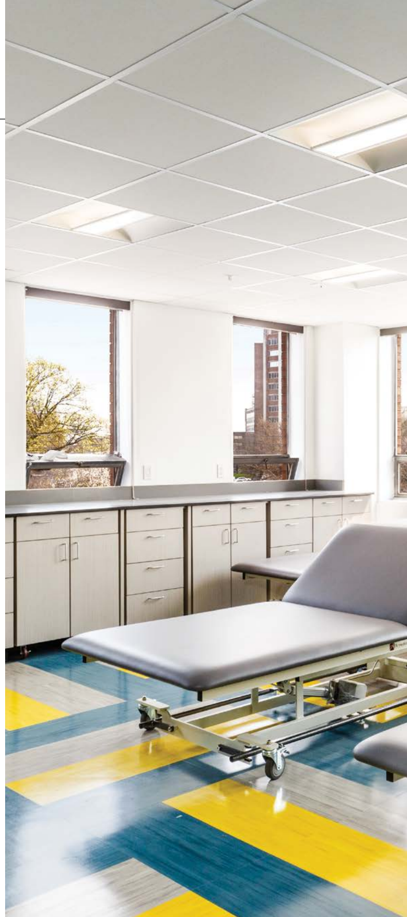
State-of-the-art exam rooms give real world experience to students in the Katz physician's assistant program.

Throughout the campuses, YU has launched sustainability initiatives, including new LED lighting which provides better illumination while saving significantly on energy costs, and upgrading to the heating, ventilating and air conditioning (HVAC). Other major projects include elevator replacement in several buildings including Cardozo Law School, Belfer Hall, 245 Lexington and Brookdale Hall, which will provide more reliable and efficient elevator service while consuming less energy.